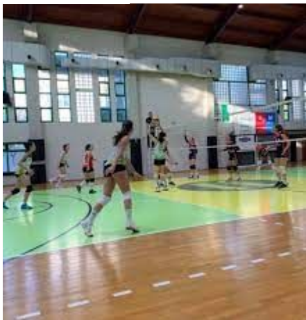
municipal volleyball court