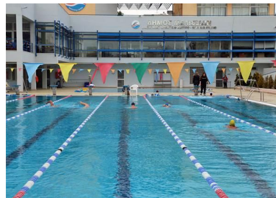
modern municipal swimming-pool in Melissia