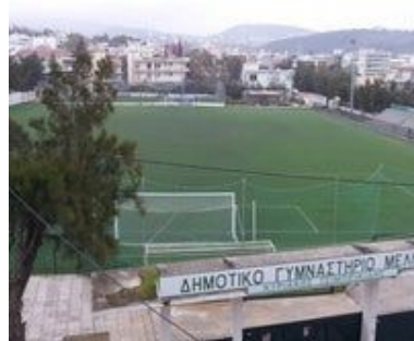
municipal football court