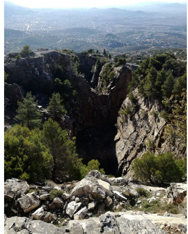
One of the Ancient marble quarries of Mount Penteli