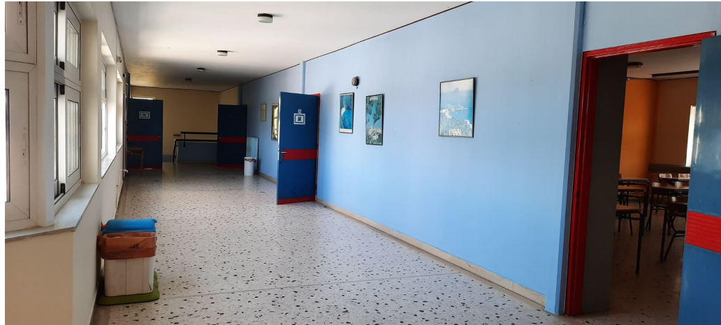
VIEWS OF ONE CLASSROOM AND FREE SPACE INSIDE