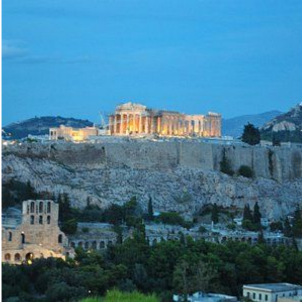
ACROPOLIS OF ATHENS