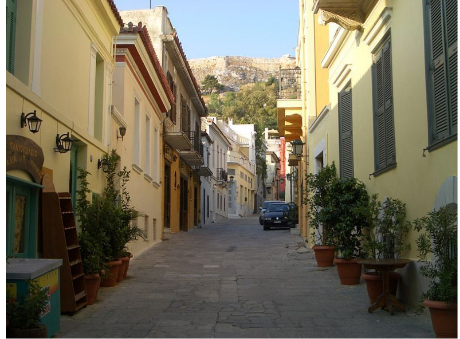
Typical street of the neighbourhood of Plaka