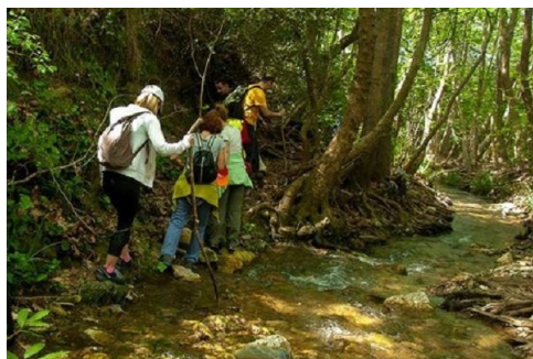
trekking in Penteli